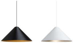
black / satin gold white / satin haze