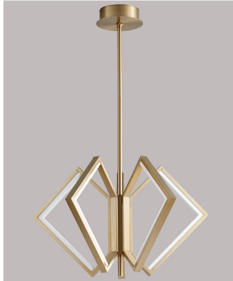
-40 Aged Brass