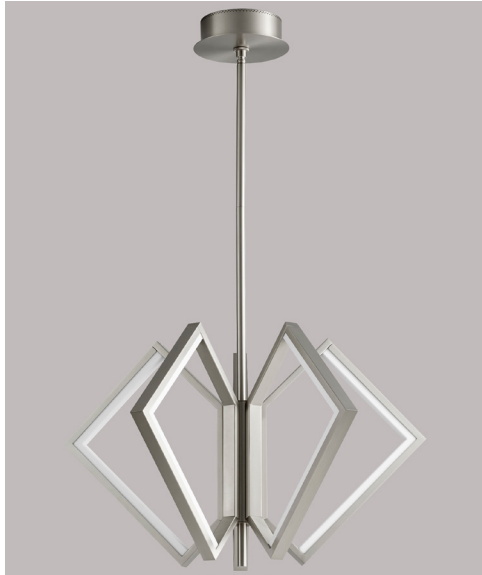
-24 Satin Nickel