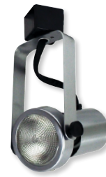
NTH-112N Natural Metal Rear Loading Gimbal