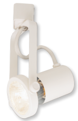
NTH-112W White Rear Loading Gimbal