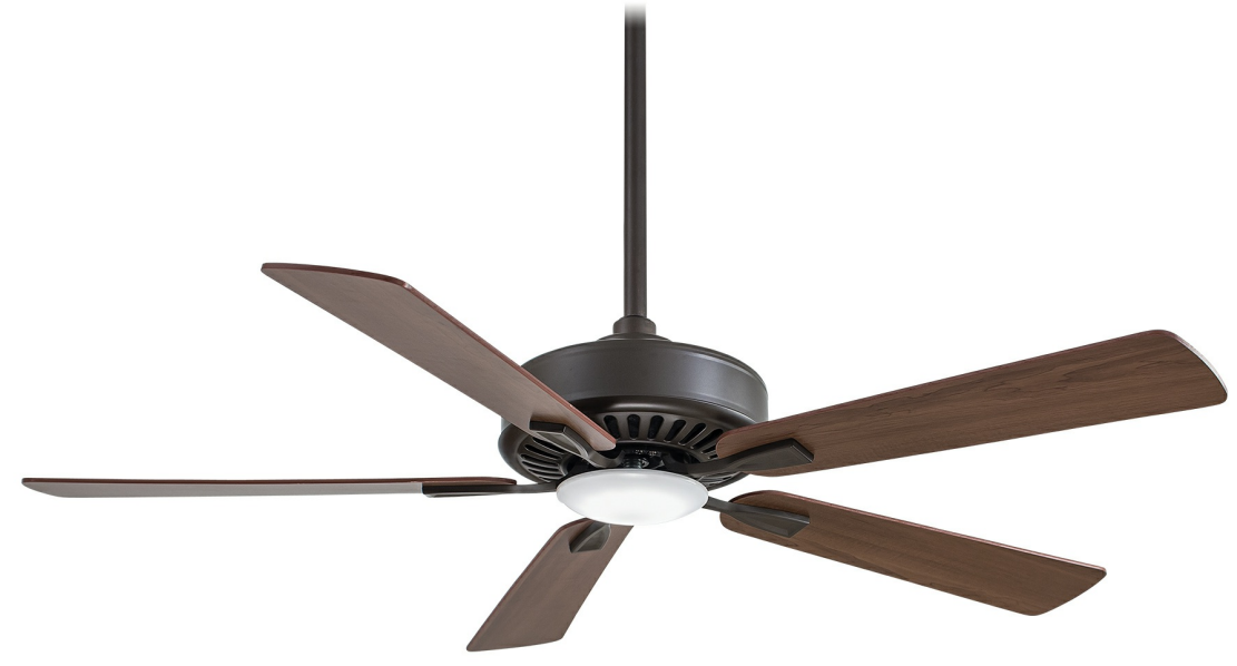
Shown with Medium Maple Blades