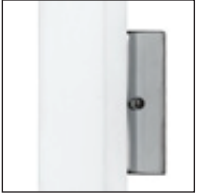
BN - Brushed Nickel