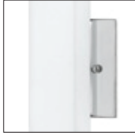
CH - Chrome