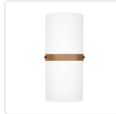
WS3413-VB Vintage Brass