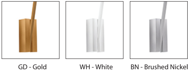
GD - Gold