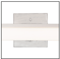
BN - Brushed Nickel