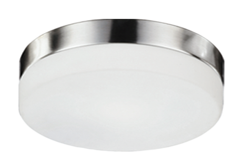
BN - Brushed Nickel