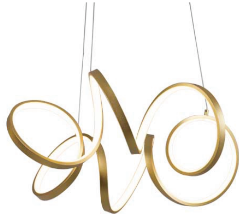
AN - Antique Brass