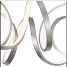
AS - Antique Silver