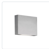
AT6606-BN Brushed Nickel