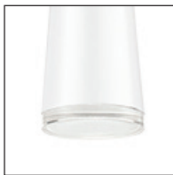
WH - White