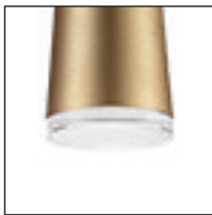
VB - Vintage Brass