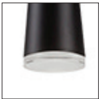
BK - Black