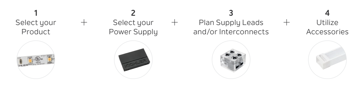
Product + Power Supply + Leads and Interconnects + Accessories = Lighting Systems

The ability to build a lighting system is one of the many things that makes low-voltage LED tape and accent lighting so versatile. With the right components, you can install lighting just about anywhere your supply wire can take you, including residential installations on kitchen cabinets, garage work stations, shelving and decorative spaces. To build your system, you'll need: