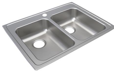
Shown with one-hole configuration. Other configurations available.

Quality Grade Plumbing Products. Since 1933 we have become the industry standard for designing and producing quality grade plumbing products and fixtures. Our role as an industry leader remains unsurpassed.