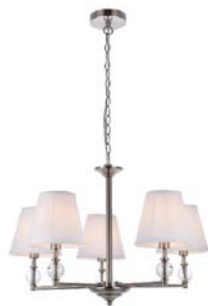
Stain Nickel Item No:LD7024D25SN