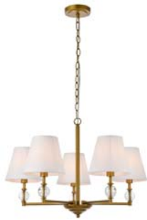
Brass Item No:LD7024D25BR