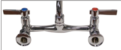
BACK VIEW 1/2" NPT(INSIDE THREAD)

FAUCET AERATOR CONFORM TO ASTM.A112.18.1M • 1.5 GPM/5.7 LP THREAD: 55/64 - 27 FEMALE